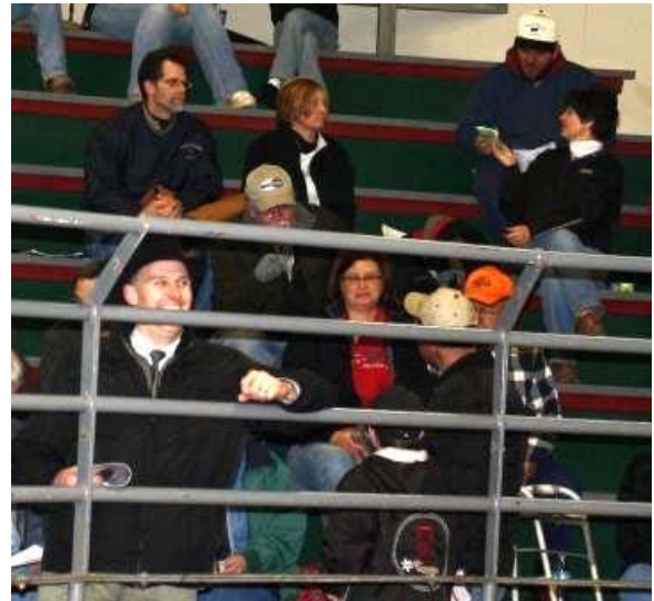
Crowd enjoying the ILBA State Sale